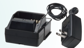
Charger BC-2012 AC adaptor for charger BC-2012