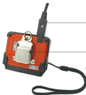
AC adapter (Part No. 2594 0898 30)