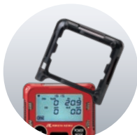
Protective cover (Part No. 4777 4161 10)