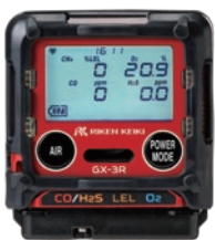
Appearance when attached