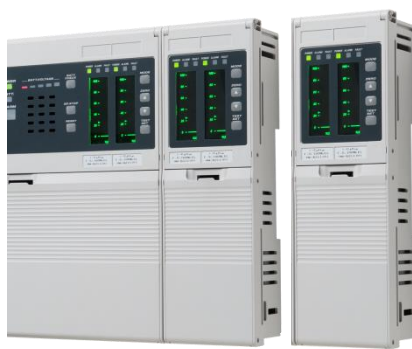
Indicator unit (2-channel)