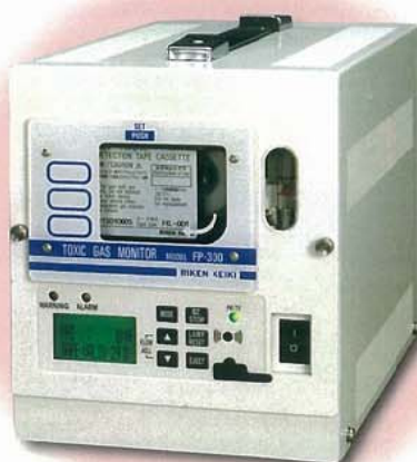
(Desk top type)