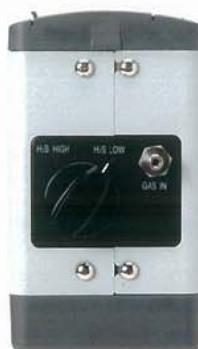
<H 2 S LOW>