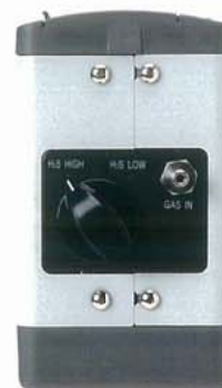
<H 2 S HIGH>

To measure high concentration Hydrogen sulfide (H 2 S), the model RX-517 applies a special H 2 S sensor with range 0-1,000ppm. When measuring high concentration H 2 S, turn the switch from "H 2 S LOW" to "H 2 S HIGH". This switch changes the LCD display, and unique flow path protects other sensors from exposure to high concentrations of H 2 S.