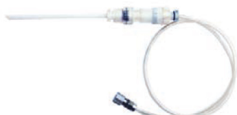
Sampling probe (with water trap function)